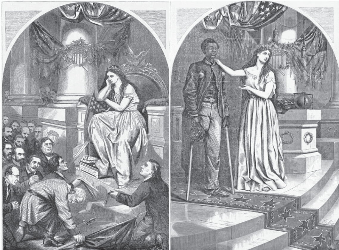
PARDON. Columbia—"Shall I Trust These Men,

Questions 2.1–2.5 refer to the following 1865 cartoon by Thomas Nast.