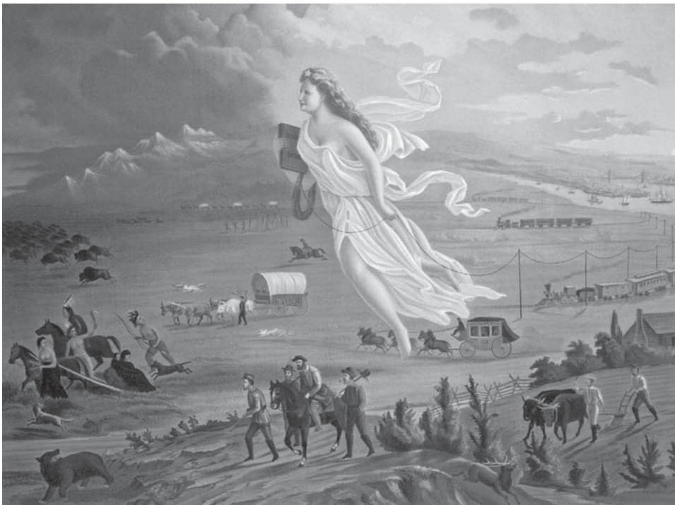
John Gast, American Progress , 1872

Question 3 is based on the following image.